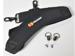
1472 Shoulder Strap