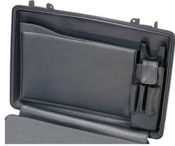
1498 Computer Lid Organizer