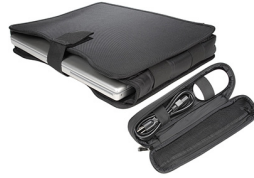
1495CBI Computer Bottom Insert