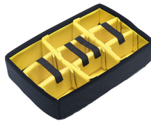
1505 Padded Divider Set