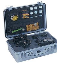
1508 Photographer's Lid Organizer