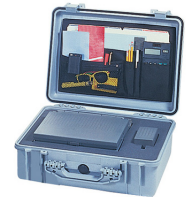
1509 Lid Organizer