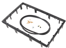
1500PF Special Application Panel Frame