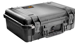
1500NF No Foam