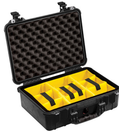
1504 With Padded Dividers