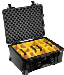
1564 With Padded Dividers