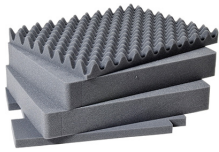
1561 4 pc. Replacement Foam Set