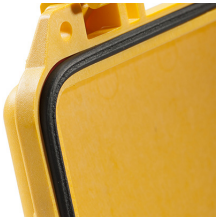
0343 Replacement O-ring