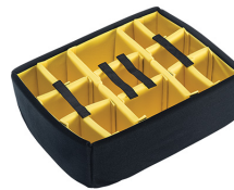
1565 Padded Divider Set