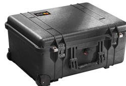
1560NF No Foam