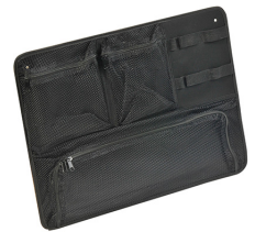
1569 Lid Organizer