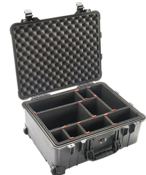
1560TP With TrekPak Divider System