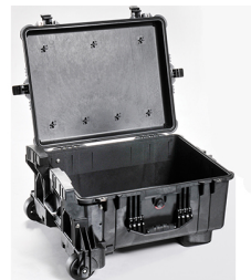
1610MNF No Foam