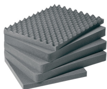
1611 5 pc. Replacement Foam Set