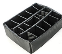
1615 Padded Divider Set