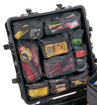
0379 Lid Organizer