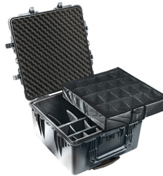
1644 With Padded Dividers