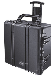
1640NF No Foam