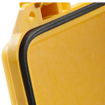
0373 Replacement O-ring