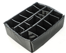
1645 Padded Divider Set