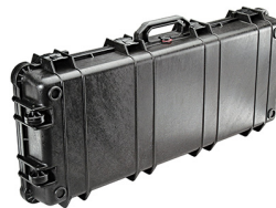
1700NF No Foam