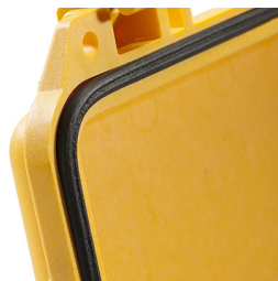
1703 Replacement O-ring