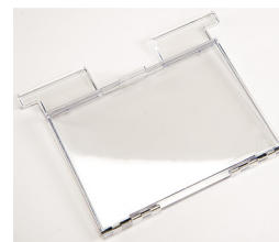
1630DC Document Container Accessory