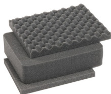
iM2050-FOAM 3 pc. Replacement Foam Set