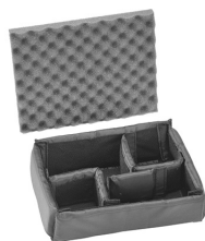
iM2050-DIV Padded Divider Set