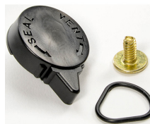
iM-VALVE-M-B Manual Purge Valve