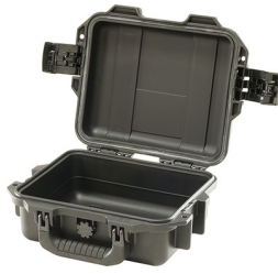
iM2050-X0000 No Foam