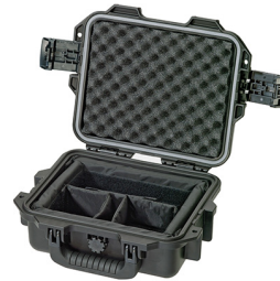
iM2050-X0002 With Padded Dividers