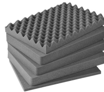
iM2450-FOAM 5 pc. Replacement Foam Set