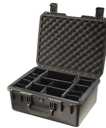
iM2450-X0002 With Padded Dividers