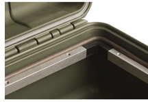
iM24XX-BEZEL Base Bezel Kit