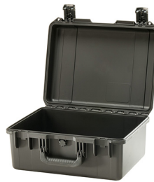
iM2450-X0000 No Foam