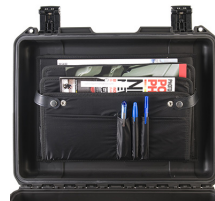
iM24XX-LIDORG Lid Organizer