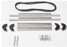
iM24XX-BEZEL-LID Lid Bezel Kit