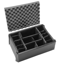
iM2450-DIV Padded Divider Set