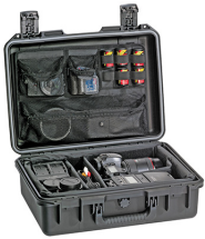
iM24XX-PHOTO PALLET Photography Pallet