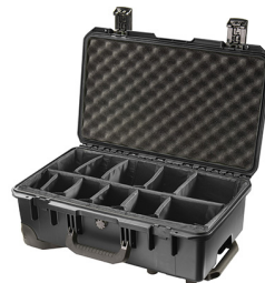
iM2500-X0002 With Padded Dividers