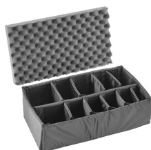
iM2500-DIV Padded Divider Set