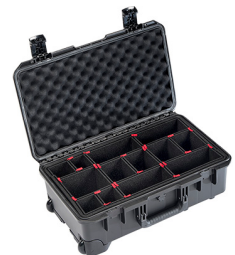
iM2500-X0006 With TrekPak Divider System