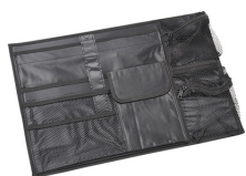
iM2500-UTILITYORG Utility Organizer