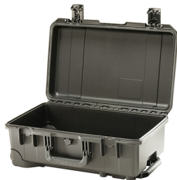
iM2500-X0000 No Foam