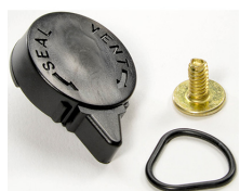
iM-VALVE-M-B Manual Purge Valve