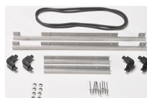
iM2500-BEZEL-LID Lid Bezel Kit