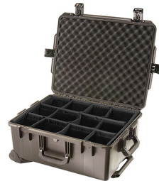
iM2720-X0002 With Padded Dividers