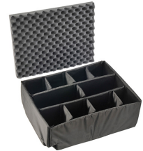
iM2720-DIV Padded Divider Set