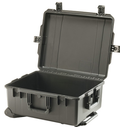
iM2720-X0000 No Foam