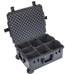
iM2720-X0006 With TrekPak Divider System