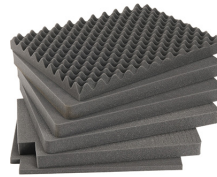
iM2720-FOAM 5 pc. Replacement Foam Set