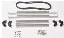
iM27XX-BEZEL-LID Lid Bezel Kit