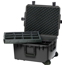
iM2750-X0002 With Padded Dividers