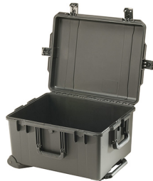
iM2750-X0000 No Foam