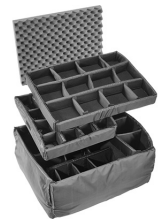
iM2750-DIV Padded Divider Set