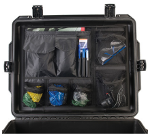
iM27XX-UTILITYORG Utility Organizer