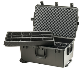
iM2975-X0002 With Padded Dividers