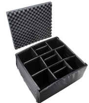
iM2975-DIV Padded Divider Set