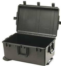
iM2975-X0000 No Foam