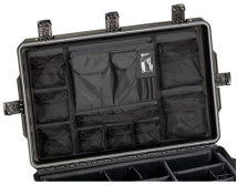
iM29XX-UTILITYORG Utility Organizer