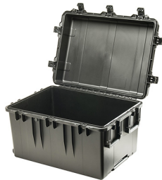
iM3075-X0000 No Foam