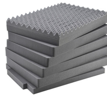
iM3075-FOAM 7 pc. Replacement Foam Set