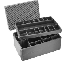
iM3075-DIV Padded Divider Set