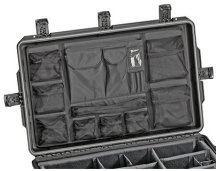
iM30XX-UTILITYORG Utility Organizer