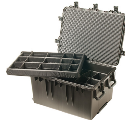
iM3075-X0002 With Padded Dividers