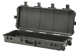
iM3100-X0000 No Foam