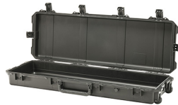
iM3200-X0000 No Foam