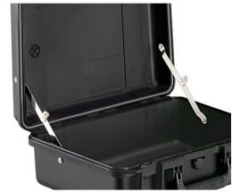
iM-LIDSTAY Lid Stay