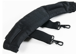
iM-STRAP-S-VER2 Padded Shoulder Strap