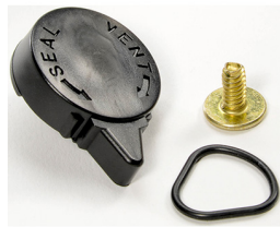
iM-VALVE-M-B Manual Purge Valve