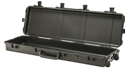
iM3300-X0000 No Foam