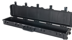
iM3410-X0000 No Foam